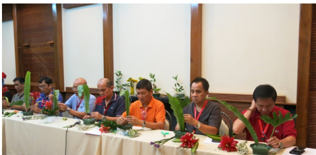
MEN OVER FLOWERS. What women can do, the men can also do.

work that we do is the highest realization of being a CESO; when you see yourself as being a clear instrument of your God to help and inspire others." In closing, she requested the leaders and managers in attendance to make use of the readymade paper mask and art materials provided to create the face of the hero that lies in them.